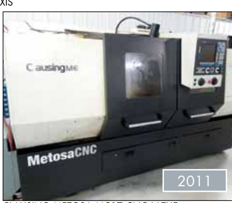
CLAUSING METOSA MC17 CNC LATHE