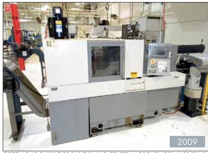
CITIZEN CNC SWISS TYPE BAR TURNING CENTER, MODEL CINCOM A32/0148, W/ EDGE CITIZEN 332 BAR FEED