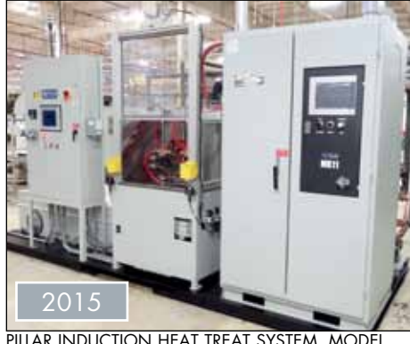
PILLAR INDUCTION HEAT TREAT SYSTEM, MODEL AB7102-114/MK 11, 200KW