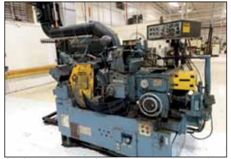
CINCINNATI MILACRON CENTERLESS GRINDERS, MODEL 220-8 CENTURAMIC DR & 20M