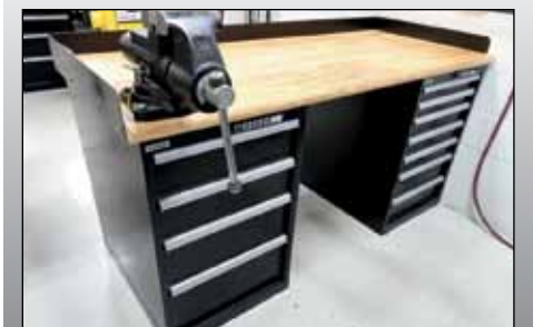
NUMEROUS LISTA WORK STATIONS