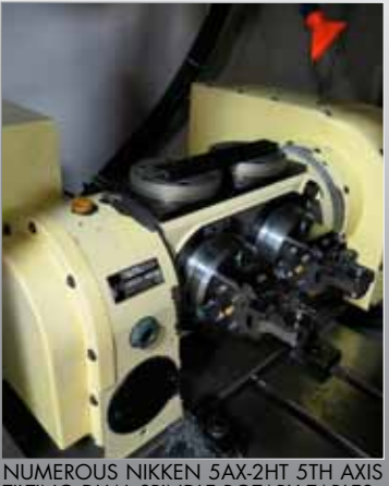
NUMEROUS NIKKEN 5AX-2HT 5TH AXIS TILTING DUAL SPINDLE ROTARY TABLES