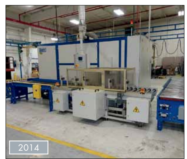
DURR ECOCLEAN AQUOUS PARTS CLEANER/ WASHER, MODEL UNIVERSAL 81W