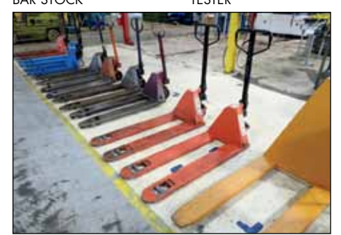
VIEW OF PALLET JACKS