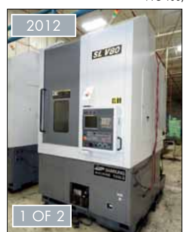
SAMSUNG CNC VERTICAL TURRETT LATHE MODEL SLV 80