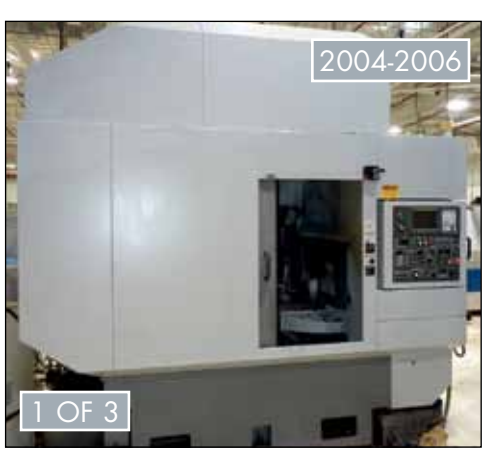
HYUNDAI KIA HIV50D CNC VERTICAL MACHINING CENTER