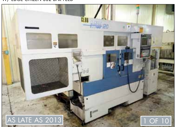
MURATEC TWIN SPINDLE CNC CHUCKERS, MODEL MW120