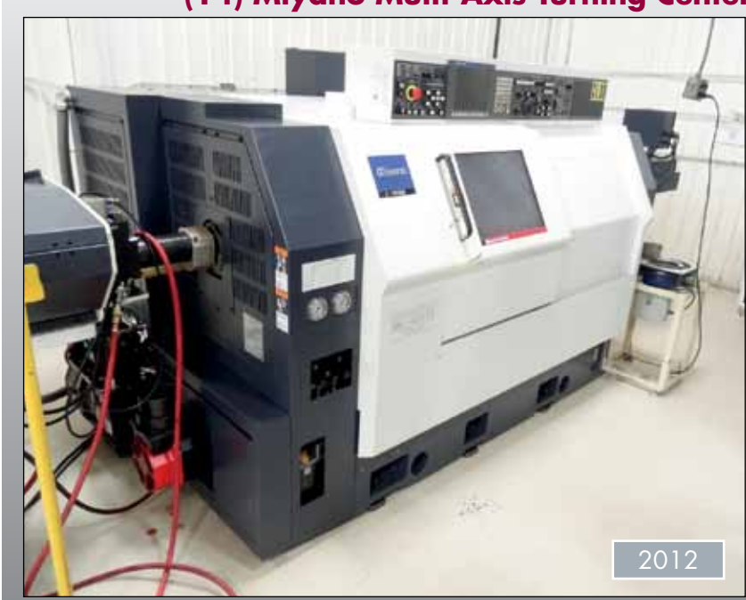
MIYANO CNC TURNING CENTERS, MODEL BNA-42S, EDGE MIYANO 542 BAR FEED