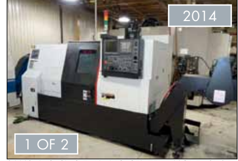
SAMSUNG CNC TURNING CENTER , MODEL SL 25 & SL25B-500