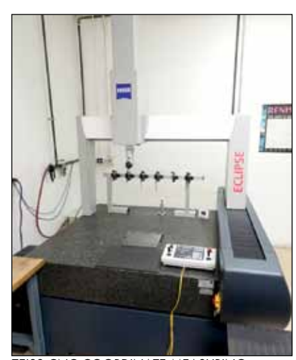
ZEISS CNC COORDINATE MEASURING MACHINE, MODEL EC4040