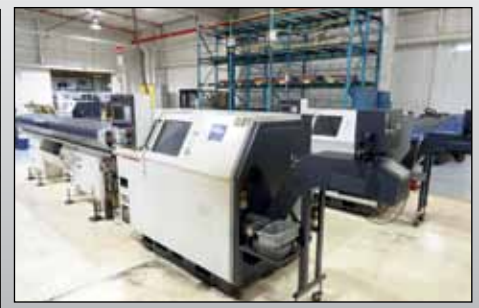
MIYANO/CITIZEN CNC SWISS TYPE BAR TURNING CENTERS, MODEL BNA-42S, EDGE-MIYANO 542 BAR FEED