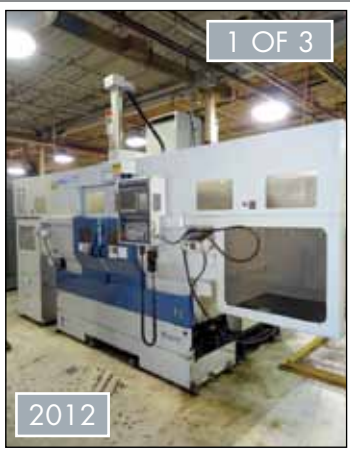
MURATEC TWIN SPINDLE CNC CHUCKERS, MODEL MW200