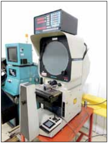
DELTRONIC OPTICAL COMPARATOR