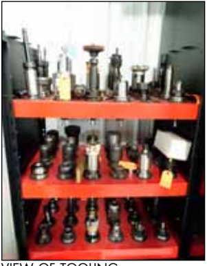
VIEW OF TOOLING