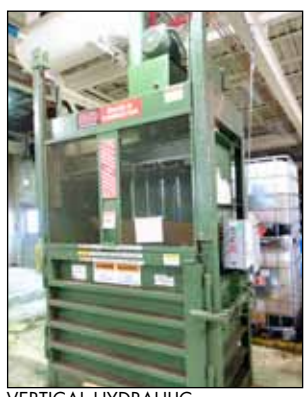
VERTICAL HYDRAULIC CARDBOARD BALER & COMPACTOR