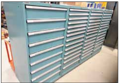
NUMEROUS LISTA TOOL CABINETS