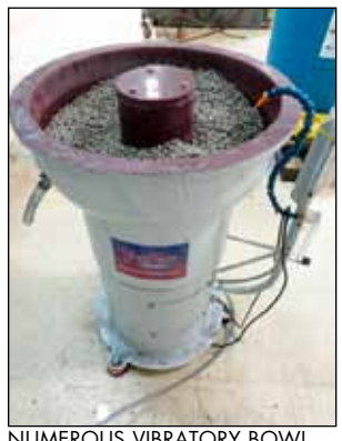
NUMEROUS VIBRATORY BOWL