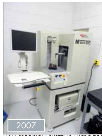
M&M PRECISION SYSTEMS MICRO-TOP 34587-B08 GEAR ANALYZER