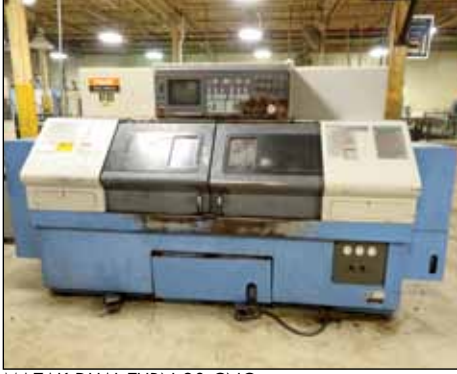
MAZAK DUAL TURN 20 CNC