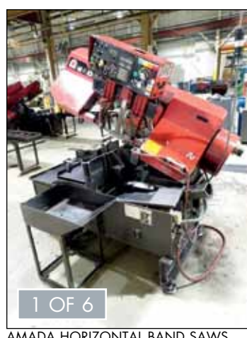
AMADA HORIZONTAL BAND SAWS, MODEL HA250W