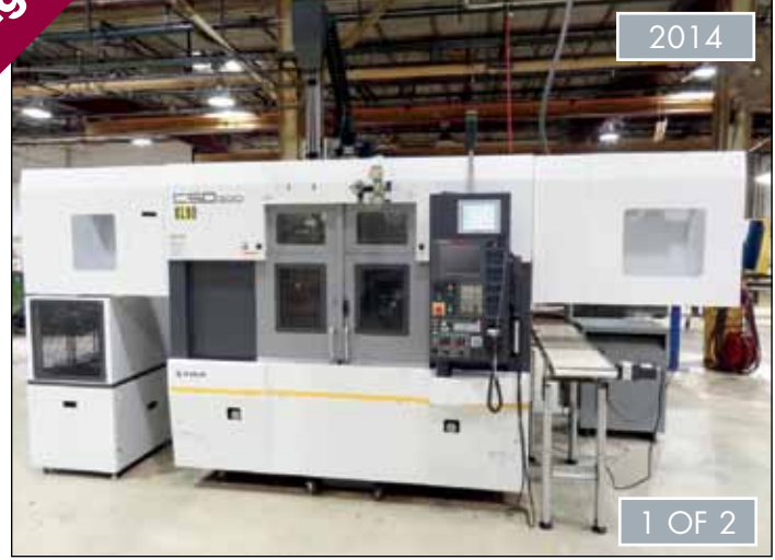
FUJI TWIN TWO SPINDLE CNC LATHE, MODEL CSD300

Live On-Site & Webcast Auction (Core Assets) Thursday June 16th, 2016 at 10:00 AM (EDT) Online Auction (Support Assets) *Electronic Bidding Only Tuesday, June 21st, 2016 at 9:00 AM (EDT)