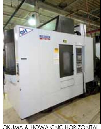
OKUMA & HOWA CNC HORIZONTAL MACHINING CENTER, MODEL MILLAC 44H