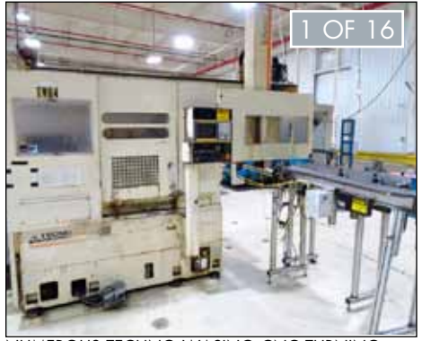
NUMEROUS TECHNO WASINO CNC TURNING CENTERS, GANTRY LOADERS & STOCKERS