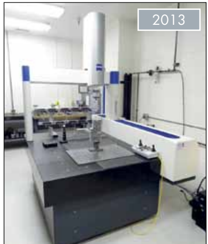
ZEISS CNC COORDINATE MEASURING MACHINE, MODEL CONTURA G2