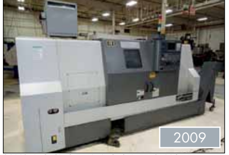
SAMSUNG CNC TURNING CENTERS, MODEL SL30A/1000