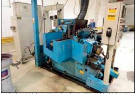
MICRON MACHINERY CNC CENTERLESS GRINDER, MODEL MD-600III-15D