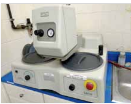
LECO DUAL HEAD POLISHER