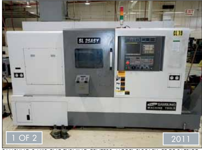
SAMSUNG 5-AXIS CNC TURNING CENTERS, MODEL SL25ASY, EDGE PATRIOT 551 BAR FEED