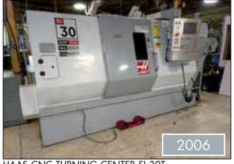
HAAS CNC TURNING CENTER SL-30T