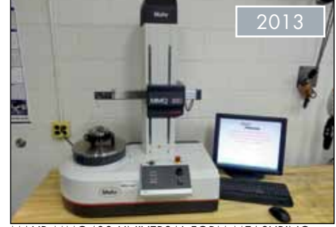
MAHR MMQ400 UNIVERSAL FORM MEASURING MACHINE, ROUGHNESS CHECKING GAGE; WITH MAHR T7W HEAD