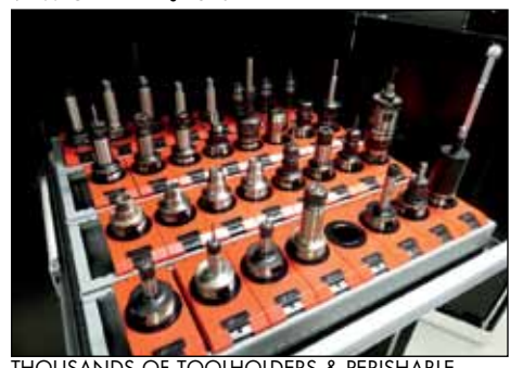
THOUSANDS OF TOOLHOLDERS & PERISHABLE TOOLING