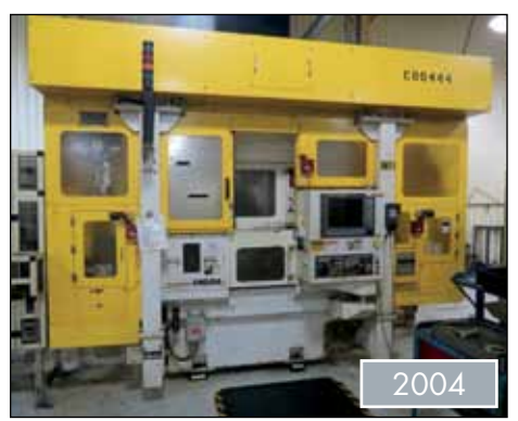
MITSUBISHI 6-AXIS CNC GEAR HOBBING MACHINE, MODEL GHD10A