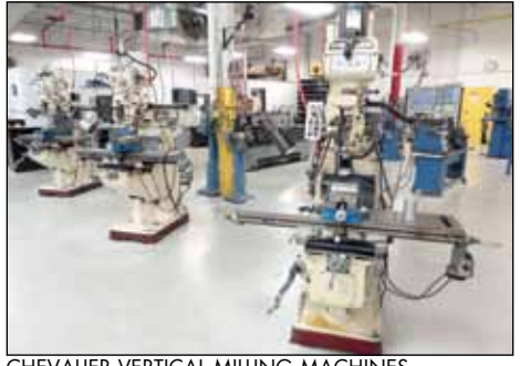
CHEVALIER VERTICAL MILLING MACHINES