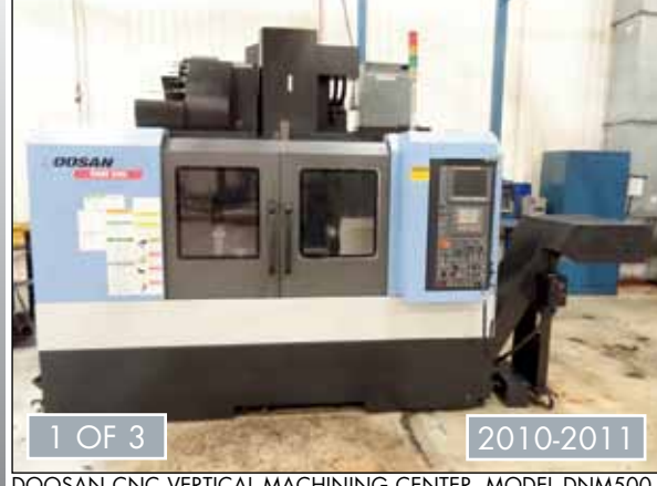
DOOSAN CNC VERTICAL MACHINING CENTER, MODEL DNM500, KOMO 4TH AXIS