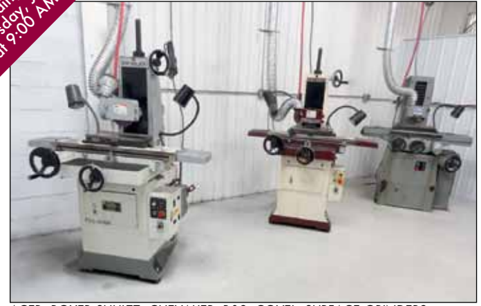
ACER, BOYER SHULTZ, CHEVALIER, B&S, COVEL, SURFACE GRINDERS