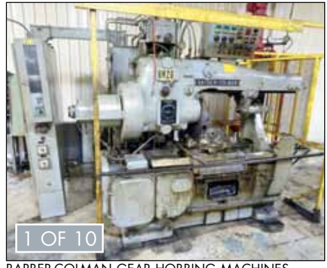
BARBER-COLMAN GEAR HOBBING MACHINES, MODELS 16-16, 16-36, & 14-15