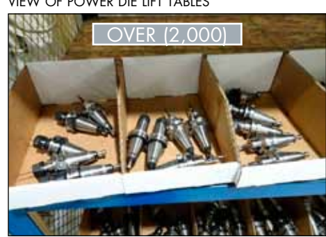
OVER (2000) 30 TAPER TOOLHOLDERS