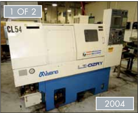
MIYANO CNC TURNING CENTERS, MODEL LZ-02RY