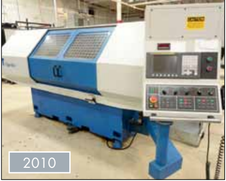
SUPERTEC CNC CYLINDRICAL GRINDER, MODEL G31A-50CNC